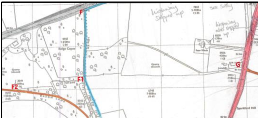
1970s road records, red letters added for reference