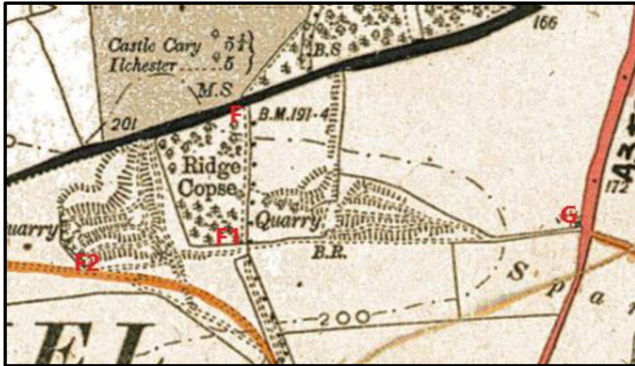
1950s road records, red letters added for reference