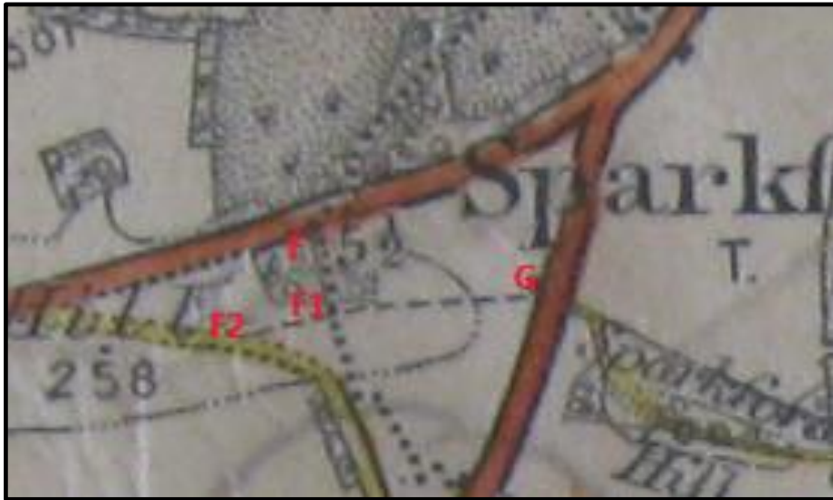
1929 Handover map, red letters added for reference