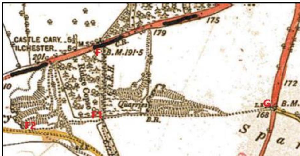
1930s road records, red letters added for reference